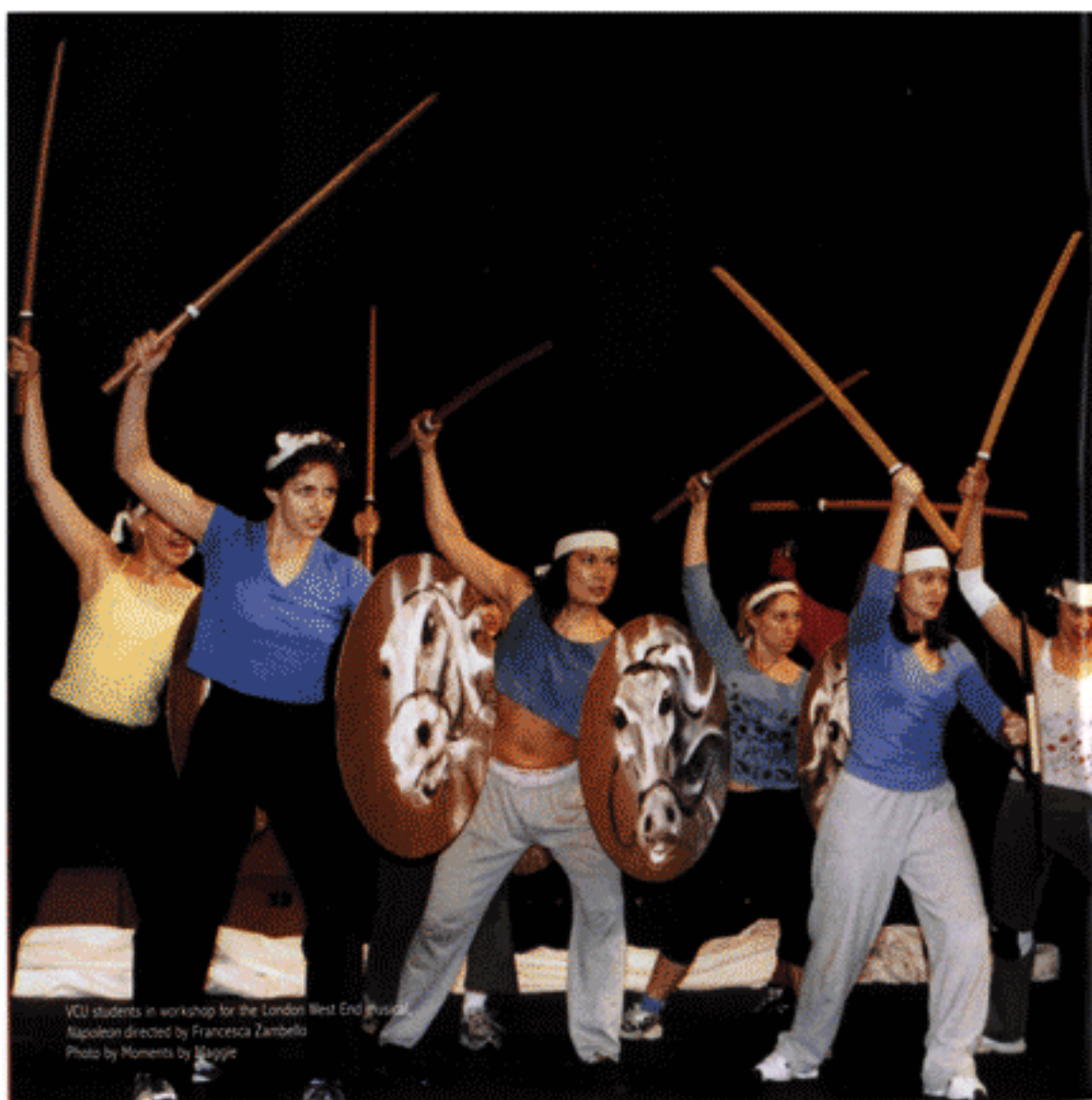
VCU students in workshop for the London West End musical Napoleon directed by Francesca Zambello